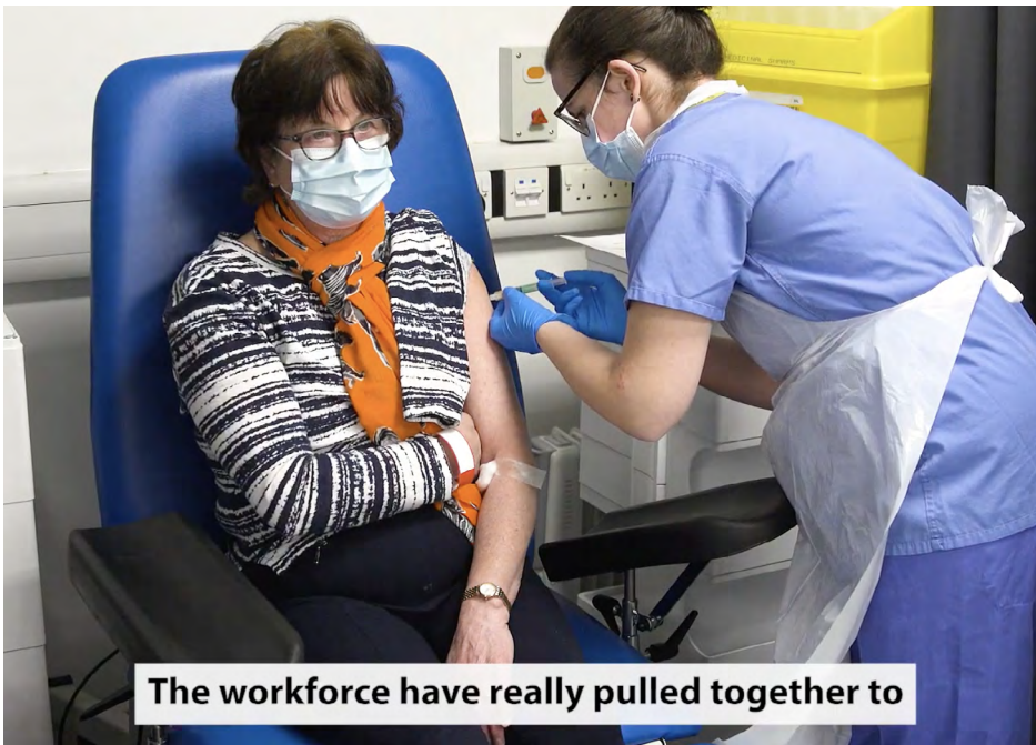
The workforce have really pulled together to