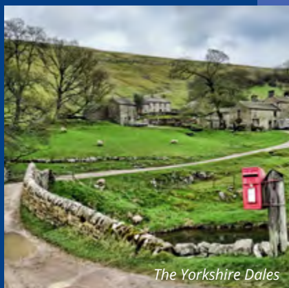
The Yorkshire Dales